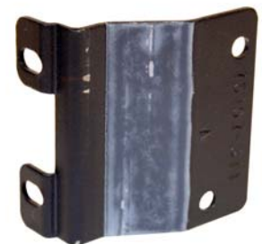
Tape location install.