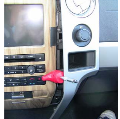
Showing method of holding open bezel to install mount.

INSTALLATION IS NOW COMPLETE. ENJOY YOUR NEW INDASH by PANAVISE MOUNT.