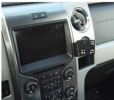
InDash installed showing location w/NAV