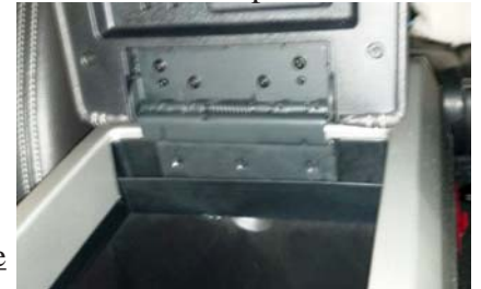
Console cover 3 screws