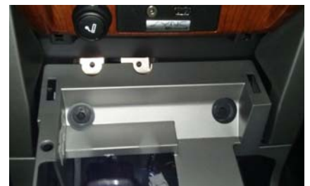
Console top bezel screws