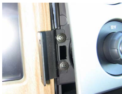
Bottom piece InDash Mount in place