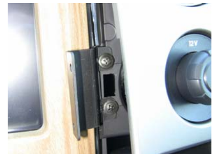
Bottom part of InDash installed. Notice clip location.