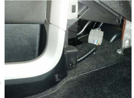
Console finish panel removed

Read instructions completely prior to starting installation. All InDash Mounts are designed so that after installation, phone is facing normal driver position for left-hand drive vehicles. This mount is not designed to be used in foreign countries with right-hand drive vehicles. Use extreme care when working around the plastic components on the dash. Excess force, can cause breakage of the plastic components.