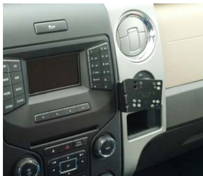
InDash installed showing location w/Radio