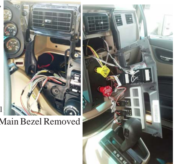
Main Bezel Removed

STEP #5: Carefully pull out the black frame from the upper right hand corner just enough to get the InDash by PanaVise Mount, guiding the mount over the top of the black frame behind the (2) screw flange at the top back of the dash cavity. Snap the black frame back in place while aligning the screw holes. Install the (2) screws. Replace all of the other screws, and snap the bezel pieces back in place in reverse order.