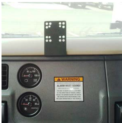
InDash Mount Installed

INSTALLATION IS NOW COMPLETE. ENJOY YOUR NEW INDASH by PANAVISE MOUNT.